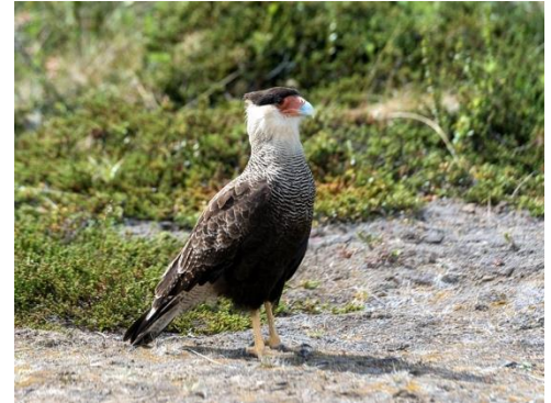
"Crested Caracara"